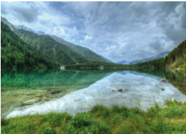
Features may change without prior notice. Mar/2019